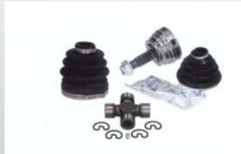
JOINTS AND BOOTS