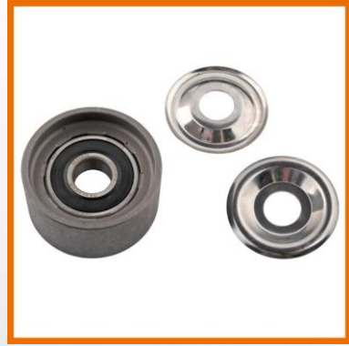
TENSIONER PULLEYS FOR HEAVY VEHICLES