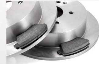
DISC BRAKE PADS