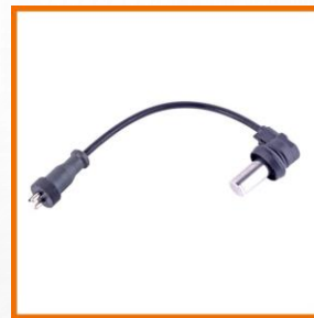
CRANKSHAFT POSITION SENSORS