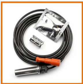
ABS/EBS SENSORS AND CABLES