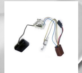
FUEL LEVEL SENSOR