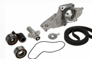
TIMING BELT KIT