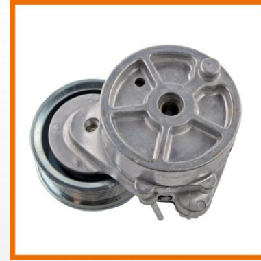
TENSIONER FOR HEAVY VEHICLES