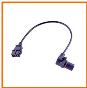
CAMSHAFT POSITION SENSORS