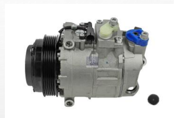
COMPRESSOR, AIR CONDITIONING, OIL FILLED