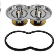
THERMOSTAT WITH GASKET