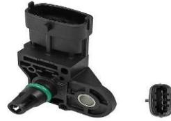
CHARGE PRESSURE SENSOR