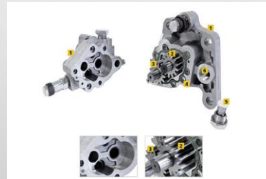
GEAR AND IMPELLER FUEL FEED PUMPS