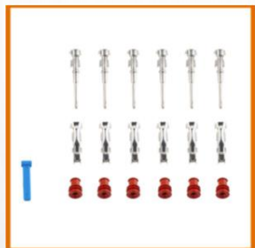
RANGE OF TERMINALS