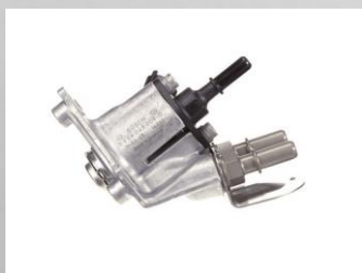
DOSING MODULE, UREA